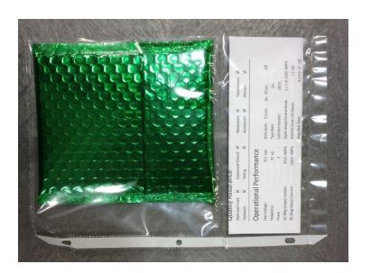
Operating Manual and Drawings

The manual is shipped with the unit in electronic format wrapped in a green bubble wrap mailer within the Accessories Box. In the manual is an extensive step by step process of how to assemble the enclosure and attach it to the unit.