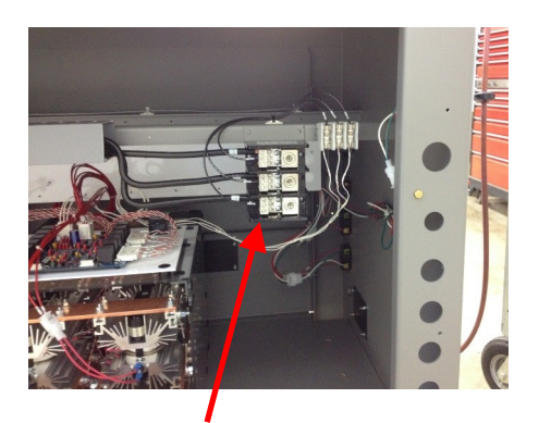
Incoming Power Connection