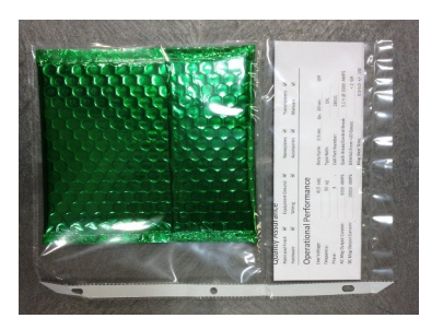
Operating Manual and Drawings

The manual is shipped with the unit in electronic format wrapped in a green bubble wrap mailer within the Accessories Box. In the manual is an extensive step by step process of how to assemble the enclosure and attach it to the unit.