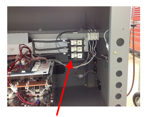
Incoming Power Connection