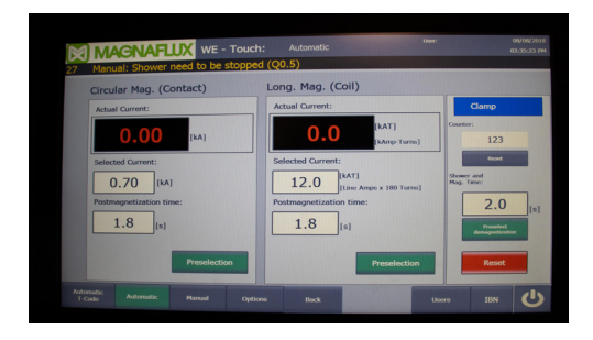
Touchscreen interface with automatic sequencing options