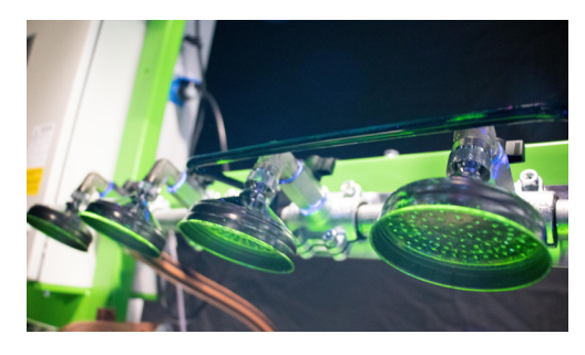
Large surface shower for hands-free bathing