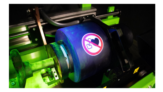
Larger flux coils for maximum multi-directional part testing capacity

For more information on the Universal WE, visit magnaflux.com/Universal-WE or contact Magnaflux customer service at <a href="magnaflux.com">support@magnaflux.com</a> or +1 847-657-5300.