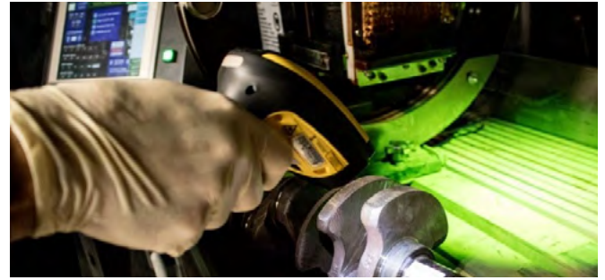
Scanner capable of reading barcodes and QR codes